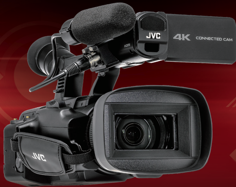
Photo shows GY-HC500 with optional microphone.